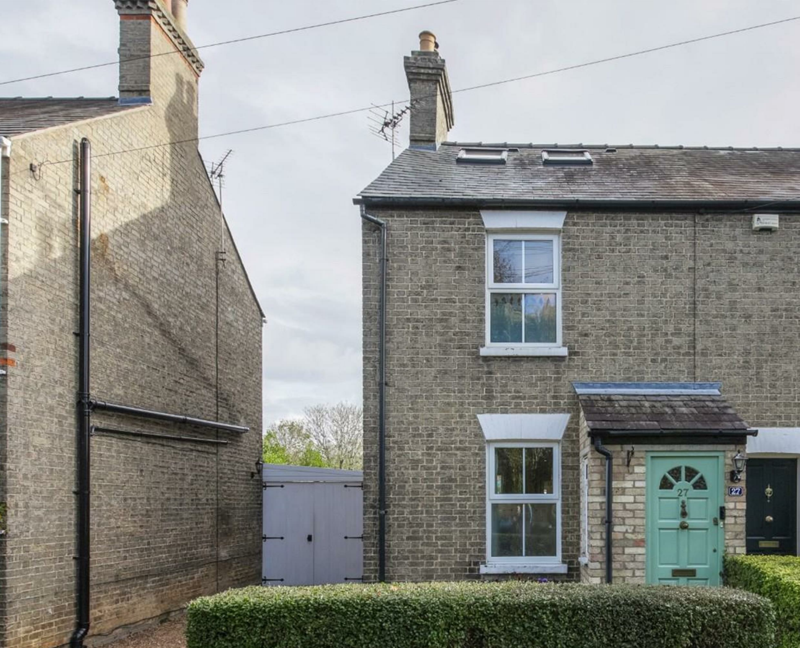
27 Cambridge Road, Impington, Cambridge, CB24 9NU Guide Price £625,000 Freehold