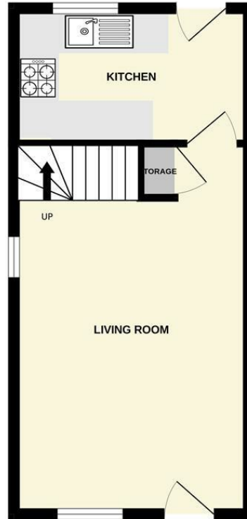
GROUND FLOOR 302 sq.ft. (28.1 sq.m.) approx.