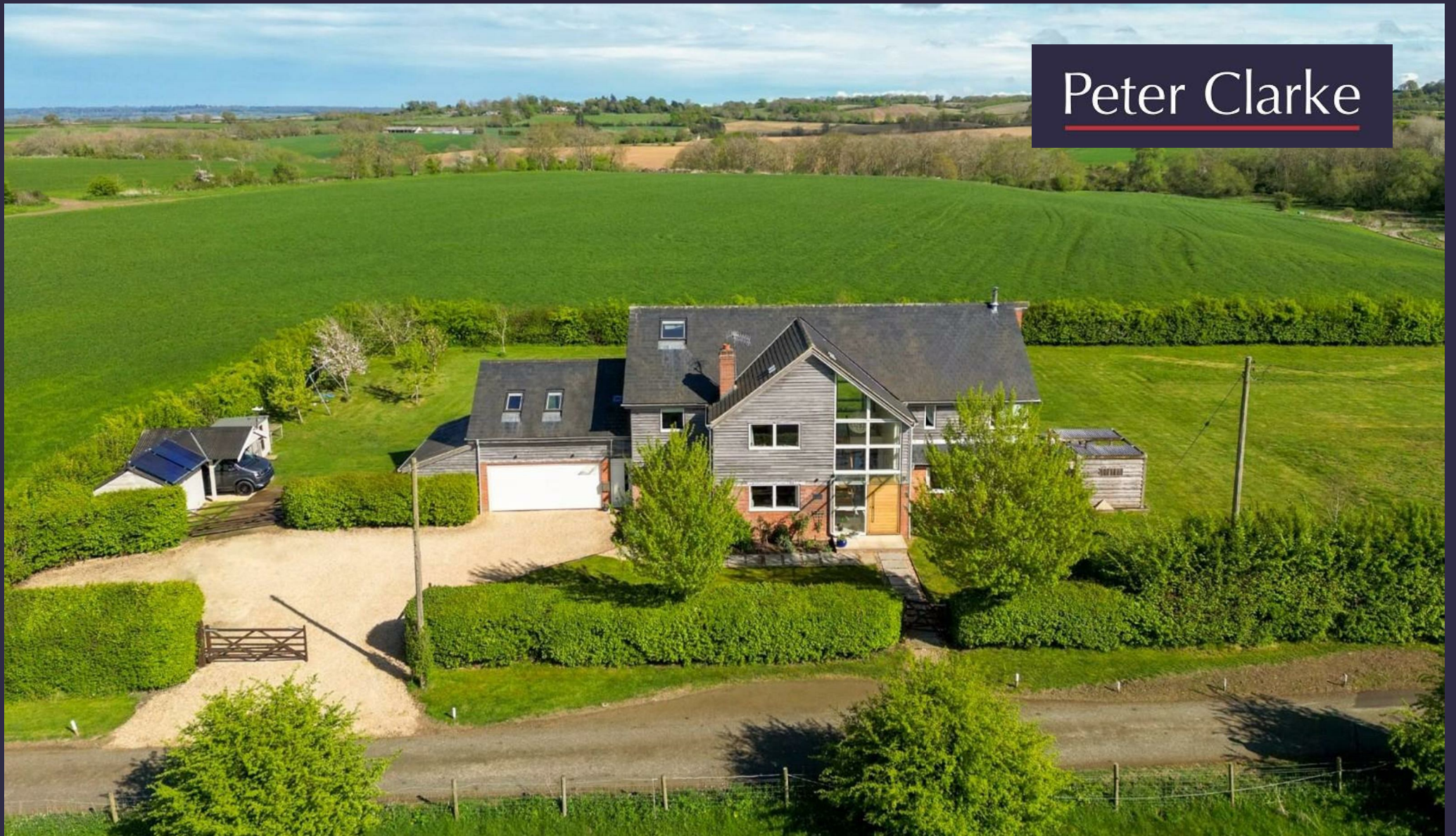
Hartfield House, Halford, Shipston-on-Stour, CV36 5DL