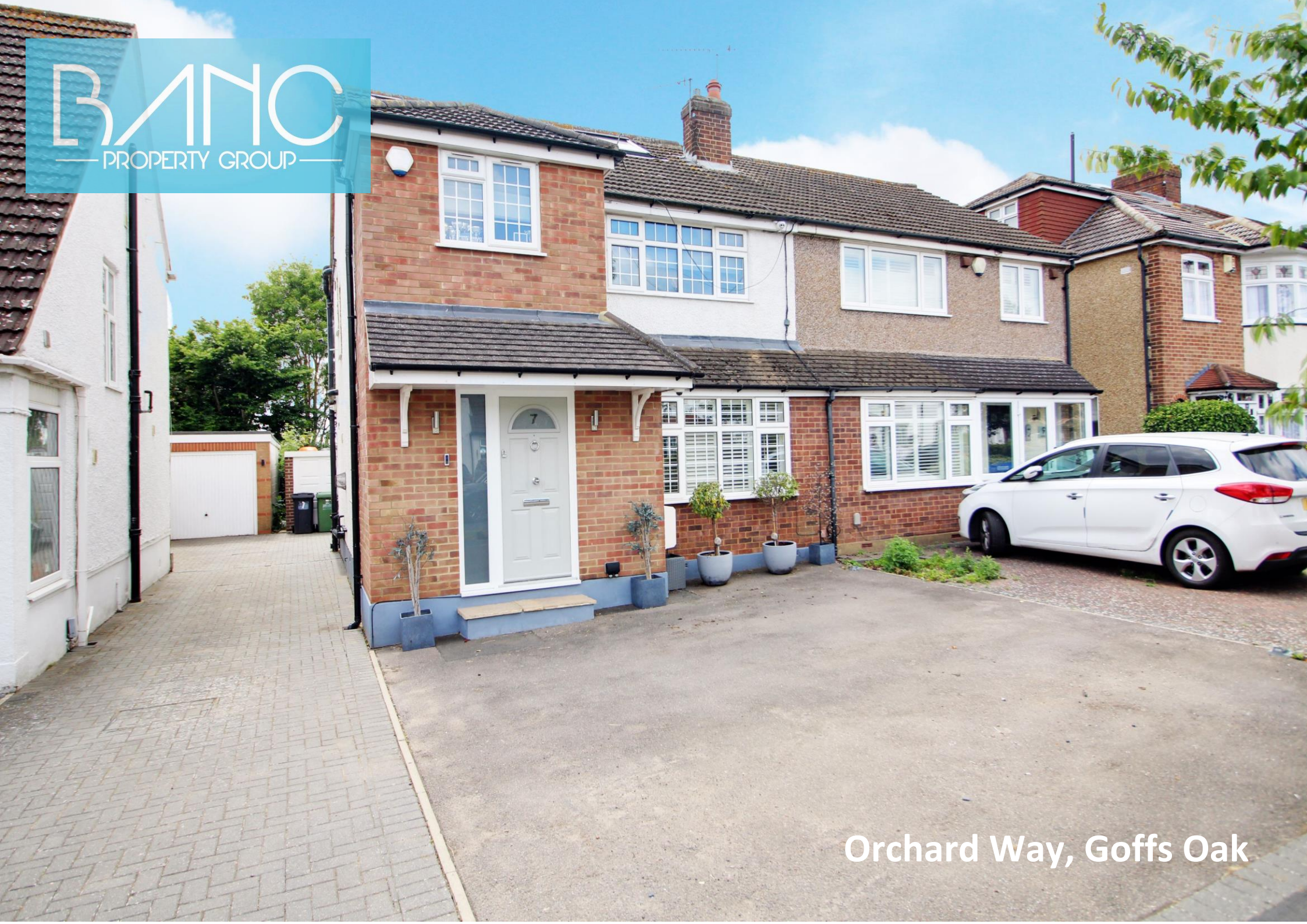
Orchard Way, Goffs Oak