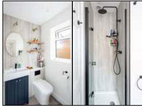
En-Suite to Bedroom One