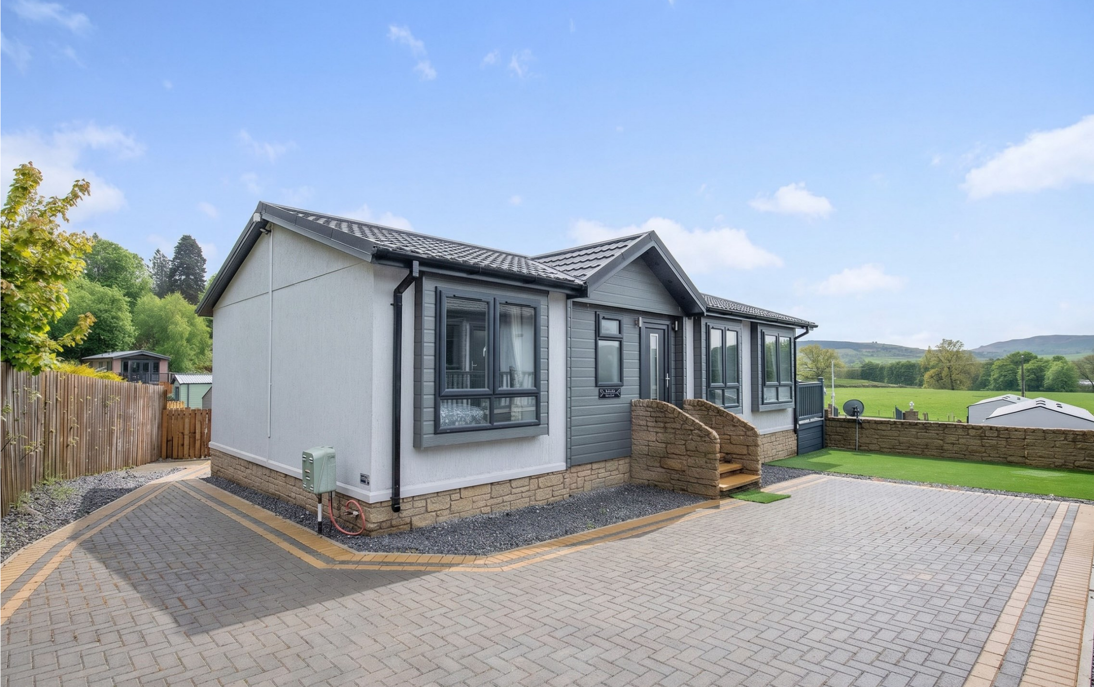
LOCH AWE LODGE, 17 WEST LODGE ESTATE, COMRIE. PH6 2LG