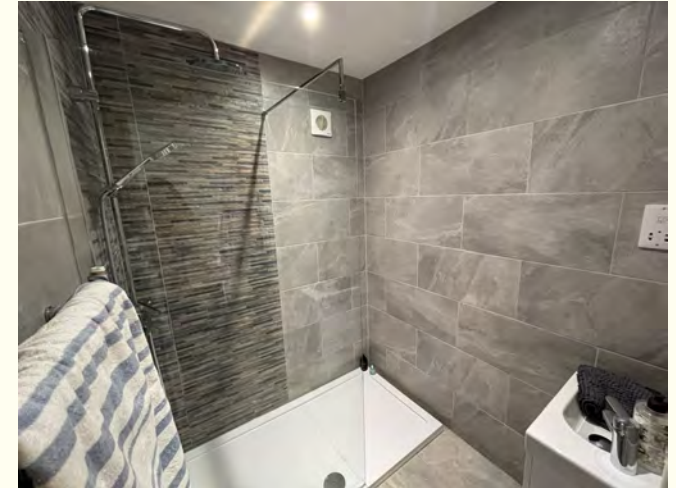
Bedroom 1 En-Suite