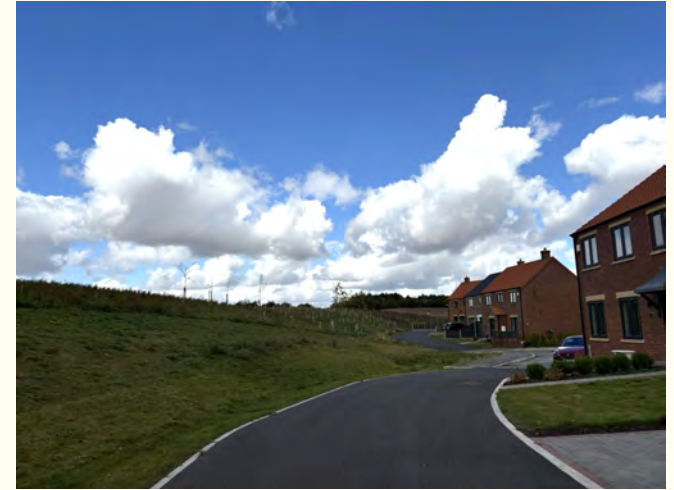
Front Open Space