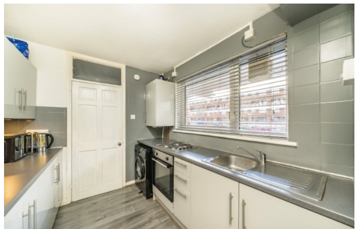
Clarence Lane, SW15