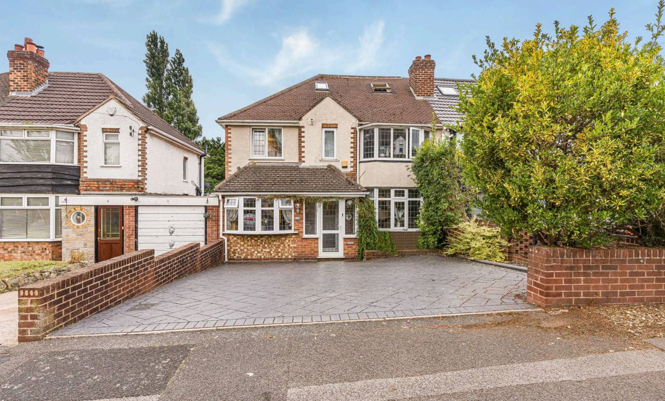
Longmoor Road, Sutton Coldfield - B73 6UB £475,000