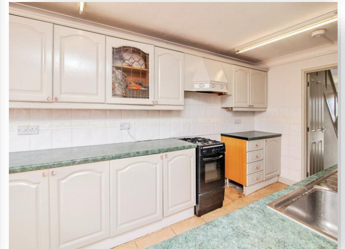
Ashridge Walk, Yaxley Peterborough PE7 3EU