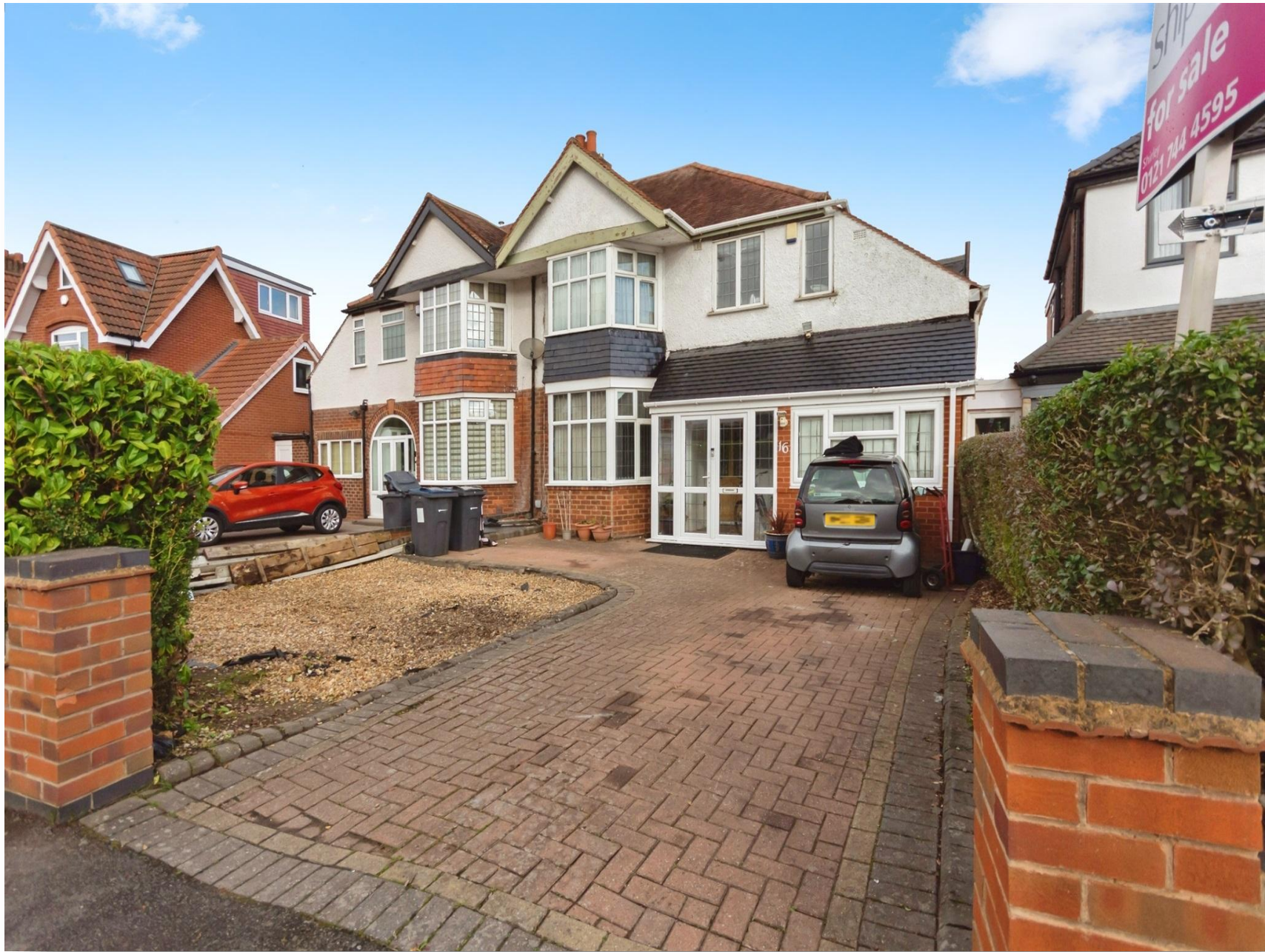
Hamlet Road, Birmingham B28 9BG