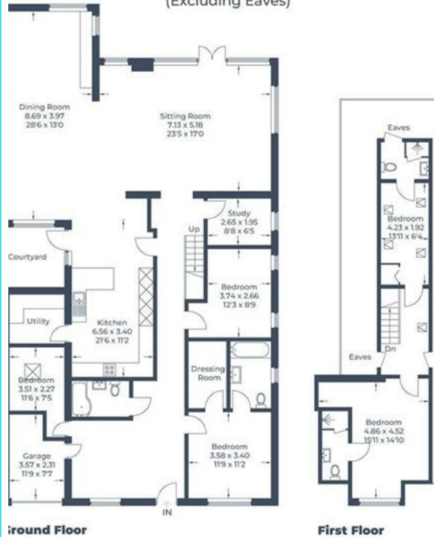
Illustration for identification purposes only, measurements are approximate, not to scale. © CJ Property Marketing Produced for Fine Homes Property

Approximate Gross Internal Area Ground Floor = 193.0 sq m / 2,077 sq ft First Floor = 39.9 sq m / 429 sq ft Garage = 7.1 sq m / 76 sq ft Total = 240.0 sq m / 2,582 sq ft (Excluding Eaves)