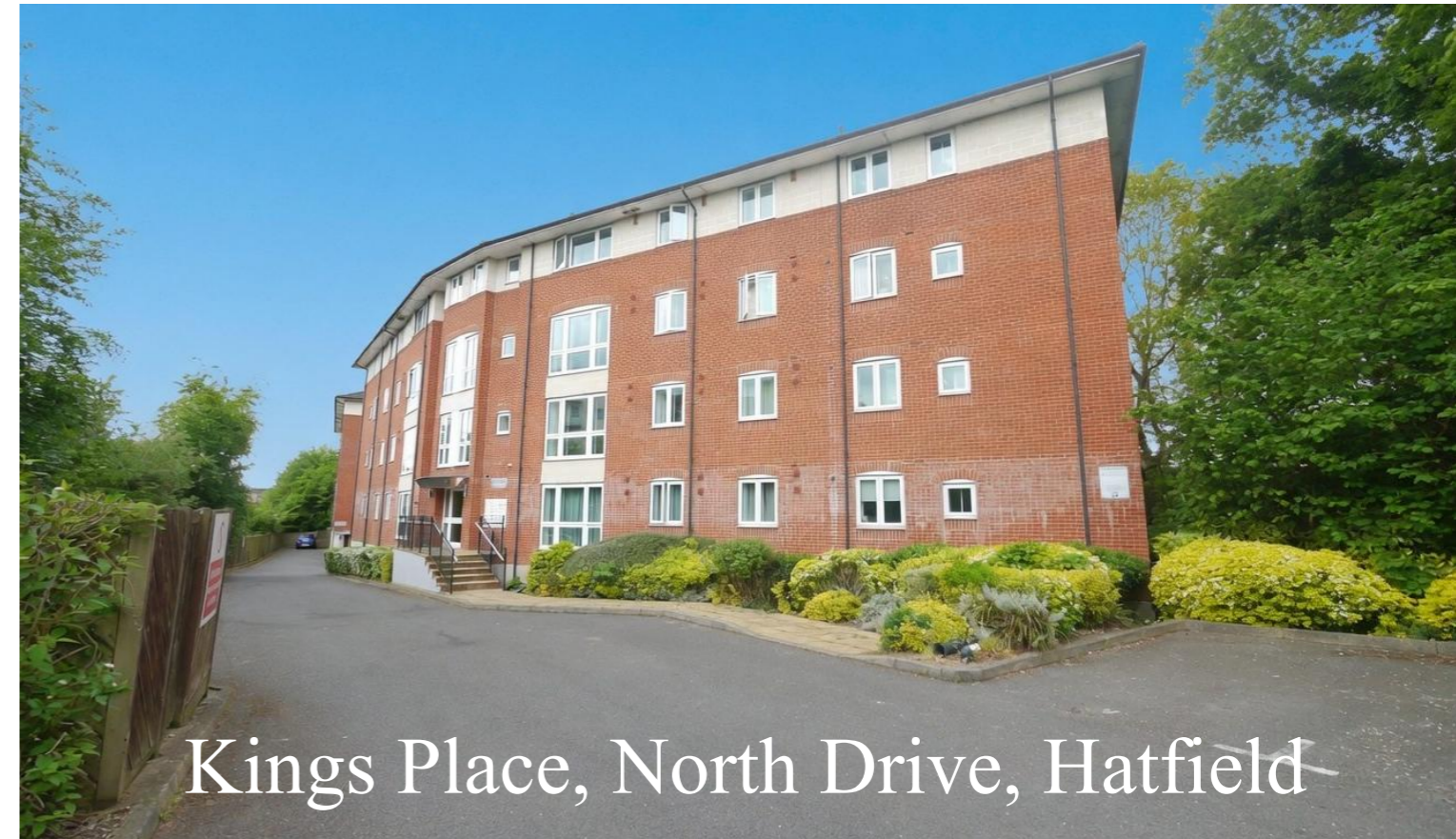
Kings Place, North Drive, Hatfield

Spacious CHAIN FREE first floor two bedroom apartment in Kings Place. Features an open plan lounge/kitchen, two good sized bedrooms (one with En-suite), family bathroom and allocated parking. Communal courtyard, lift access, secure electric gates, and only a five minute walk to Hatfield Station.