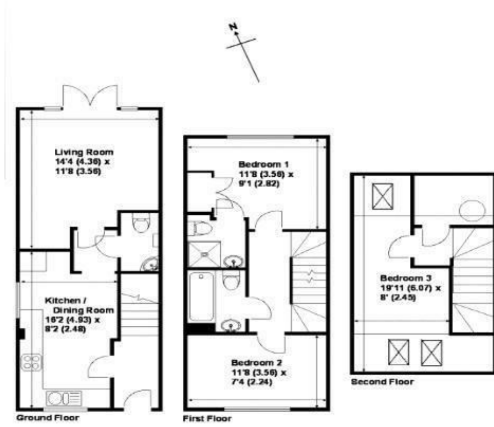
Approximate Gross Internal Floor Area - 916 sq/ft - 85 sq/mtr