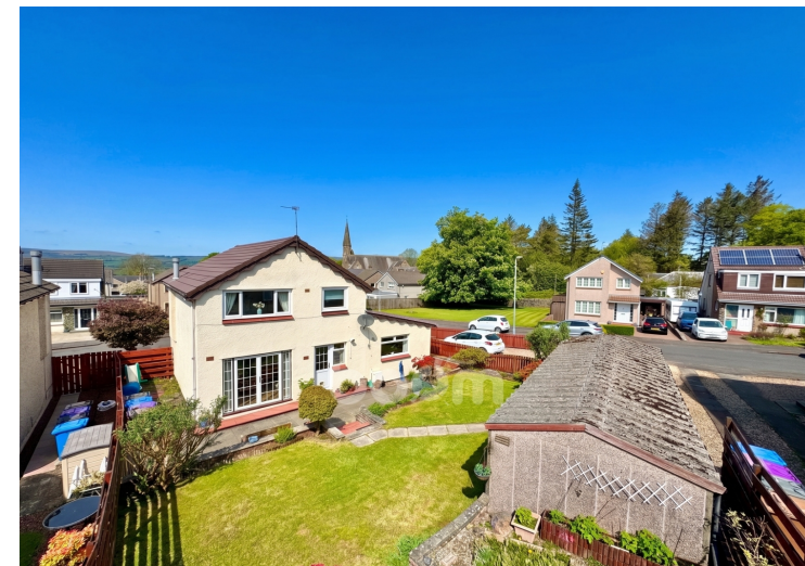
Crummock Gardens, Beith