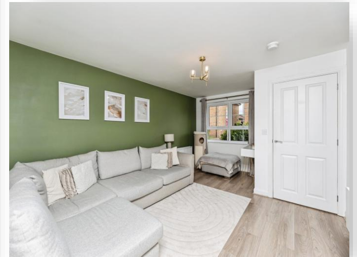
Crown Avenue, East Ardsley Wakefield WF3 2GH