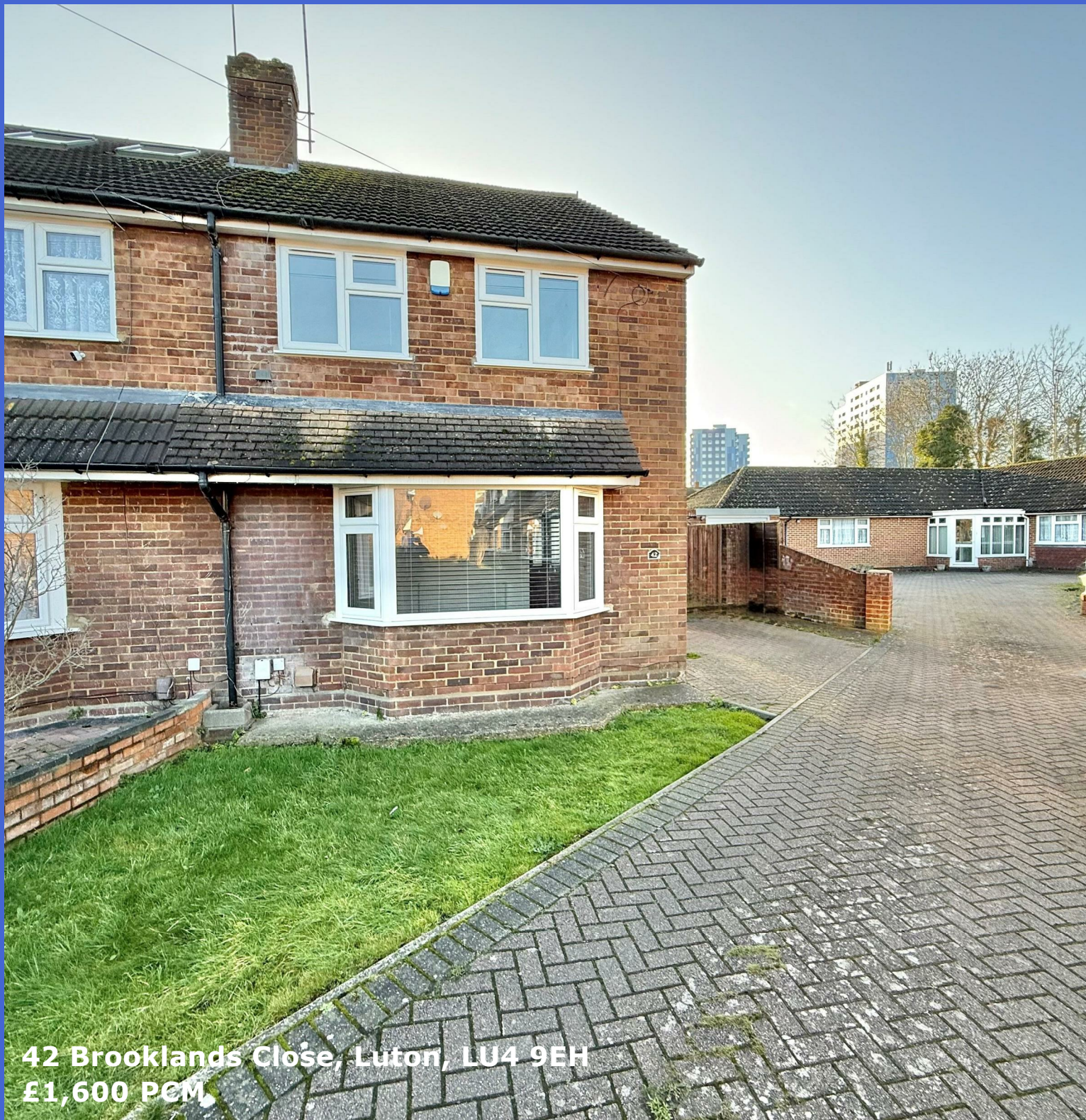
42 Brooklands Close, Luton, LU4 9EH £1,600 PCM