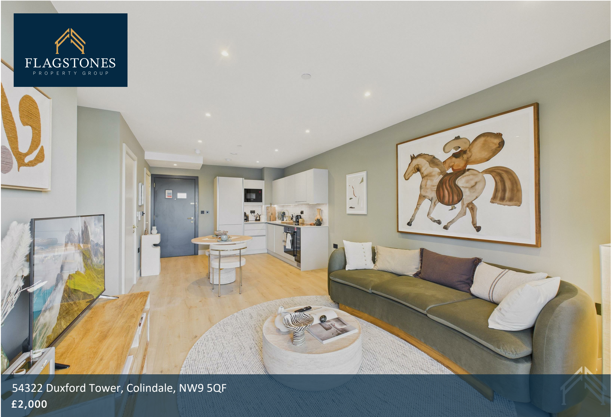
54322 Duxford Tower, Colindale, NW9 5QF £2,000