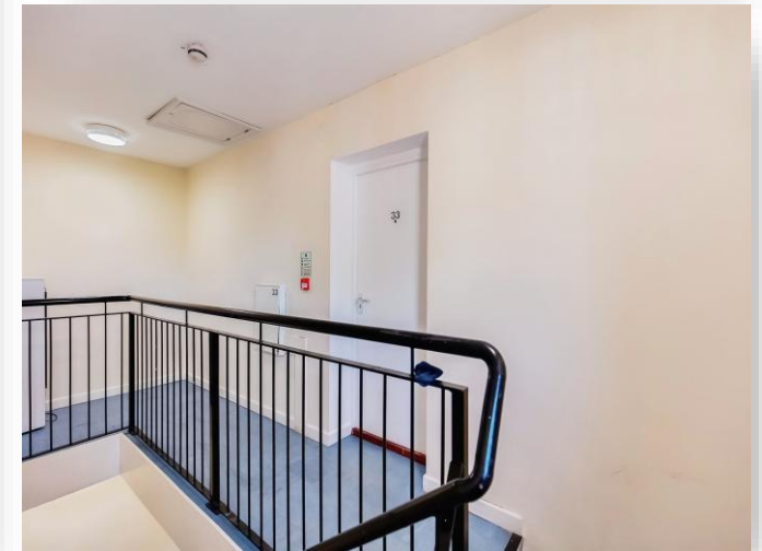
Langdale Grove, Corby NN17 2DG