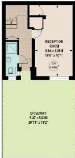
331 sq ft Ground Floor