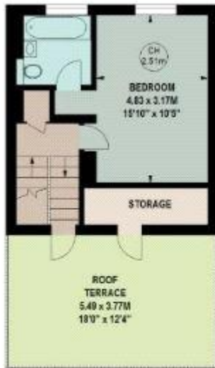
355 sq ft Third Floor