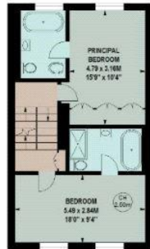
577 sq ft Second Floor