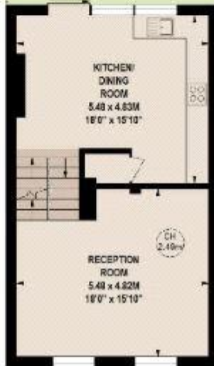
677 sq ft First Floor