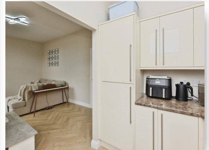
The Old County Arms Newport Road, New Bradwell Milton Keynes MK13 0AL