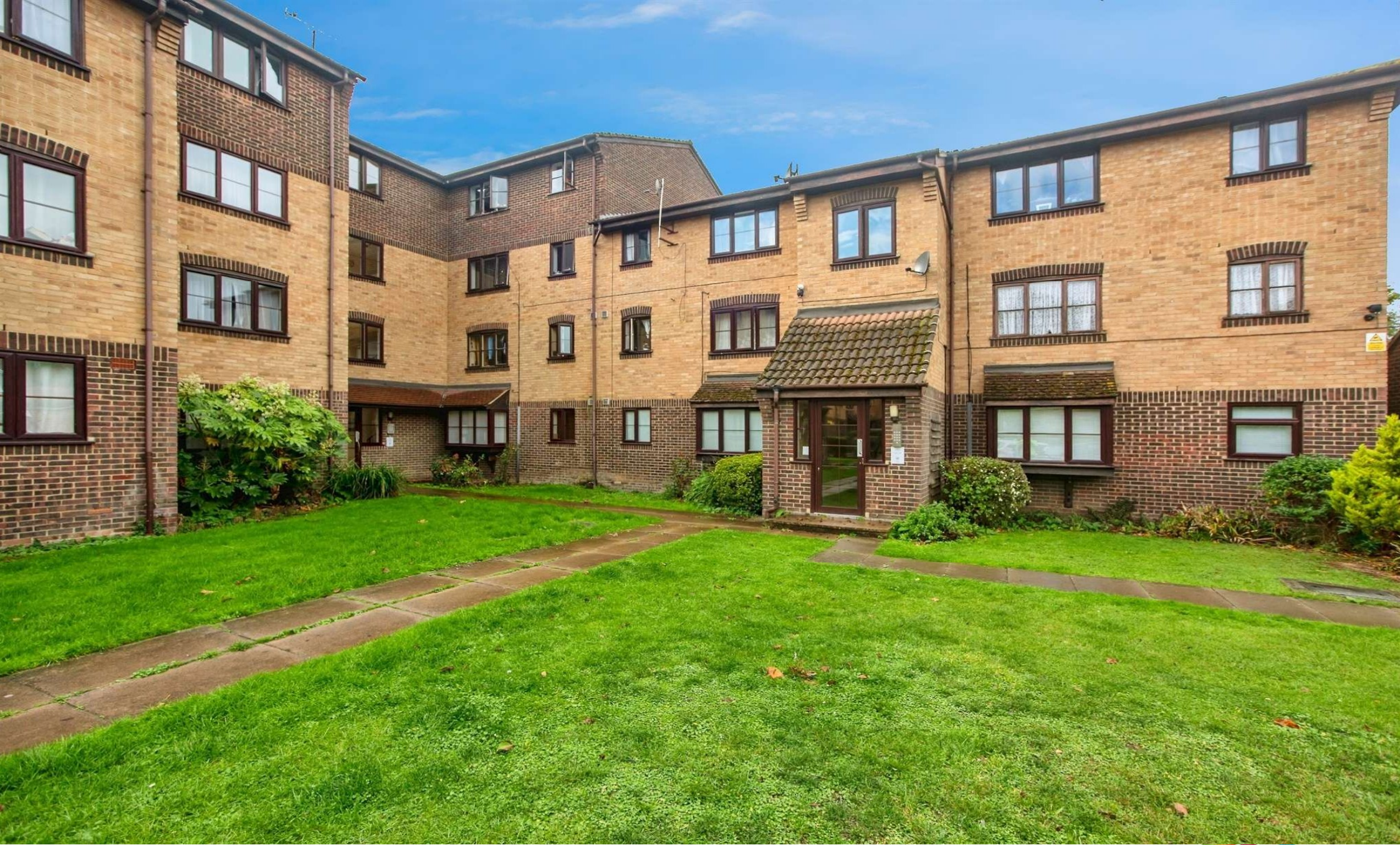
Conway Gardens, Grays RM17 6HQ