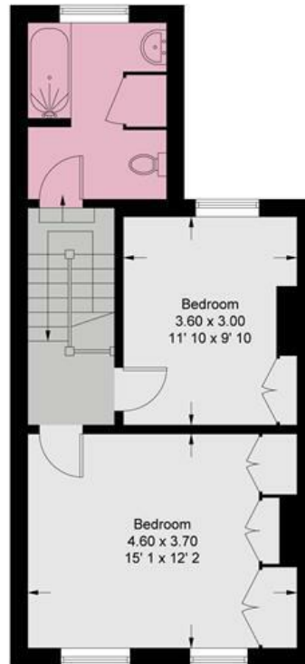
First Floor 460 sq ft / 42.7 sq m

This plan is not to scale and must be used as layout guidance only. All measurements and areas are approximate and should not be relied upon to provide accurate information. This plan must not be relied upon when making property valuations, design considerations or any other such relevant decisions. We accept no responsibility or liability (whether in contract, tort or otherwise) in relation to any loss whatsoever arising from or in connection with any use of this plan or the adequacy, accuracy or completeness of it or any information within it.