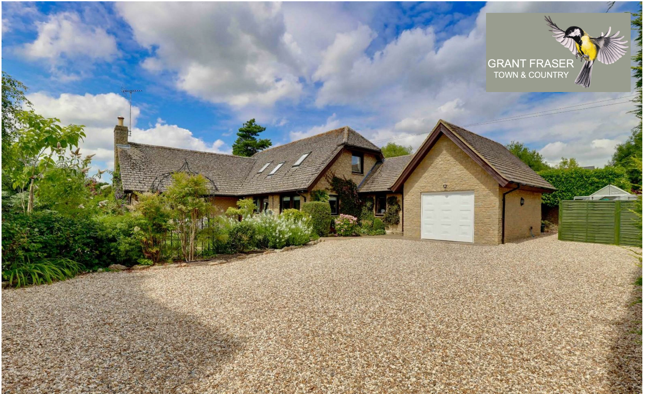
Pear Tree Farmhouse, Great Coxwell, Faringdon, Oxfordshire, SN7 7NG Guide price £700,000