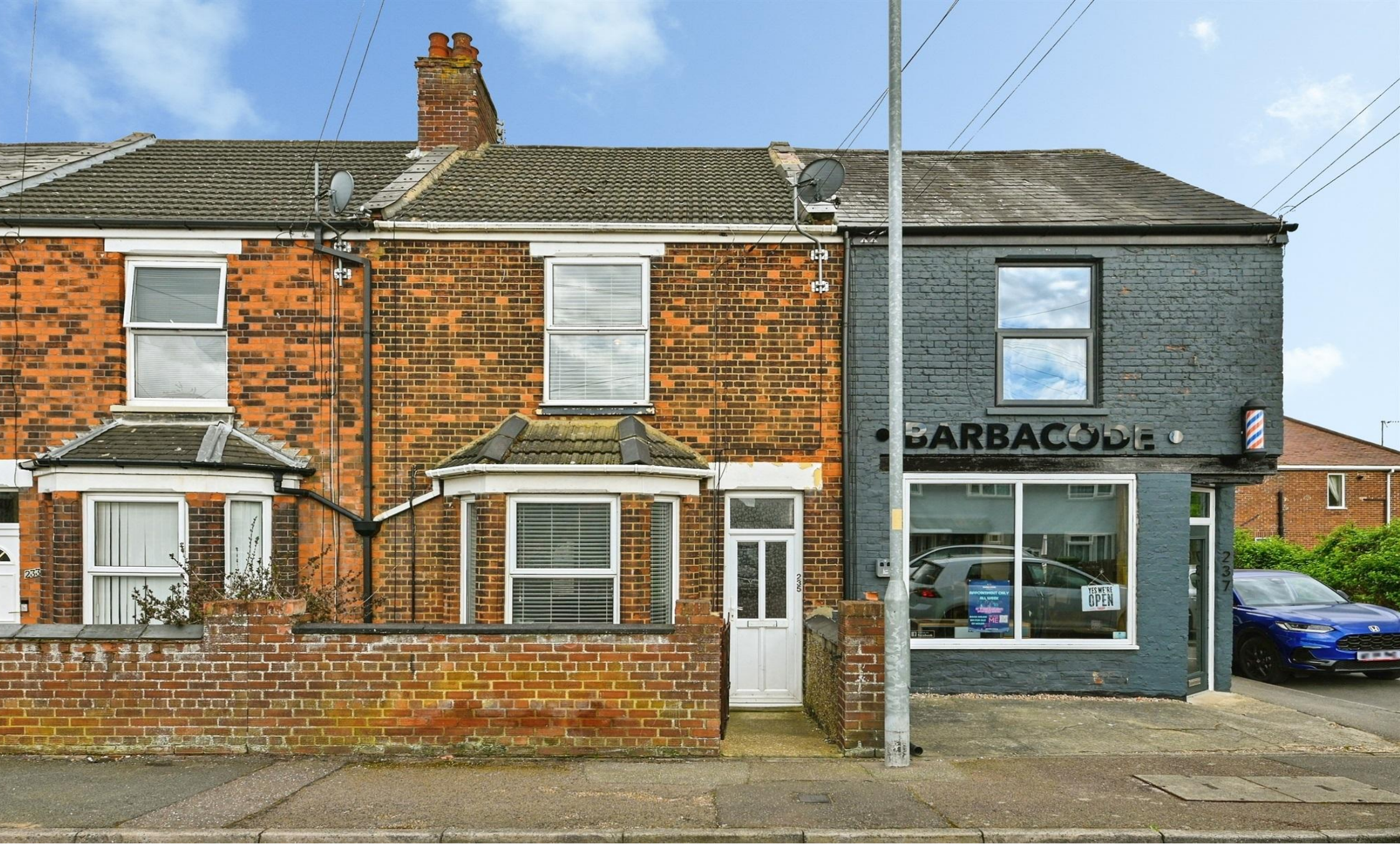
Saddlebow Road, King's Lynn, PE30 5BW