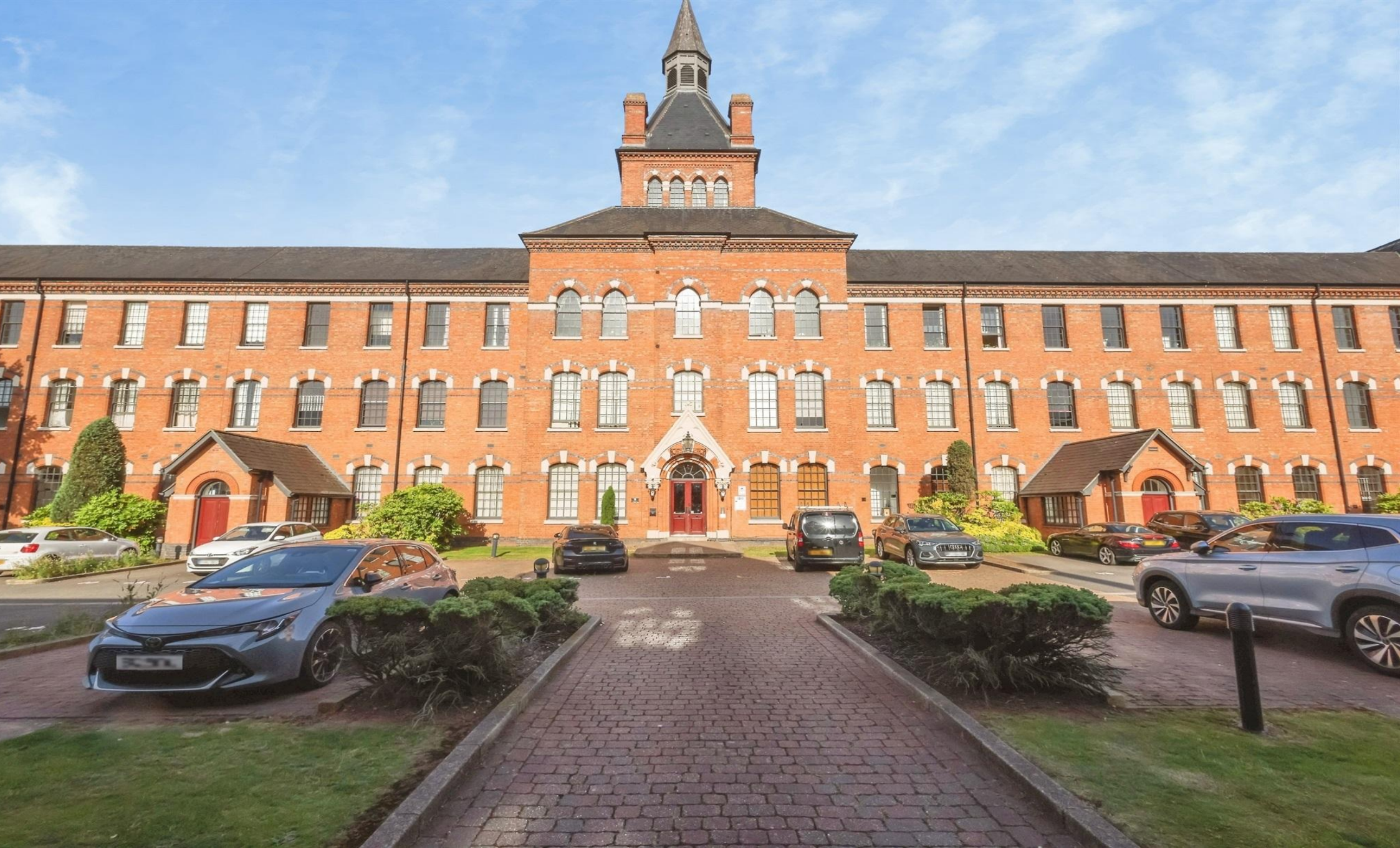
Highcroft Hall, Highcroft Road, Birmingham