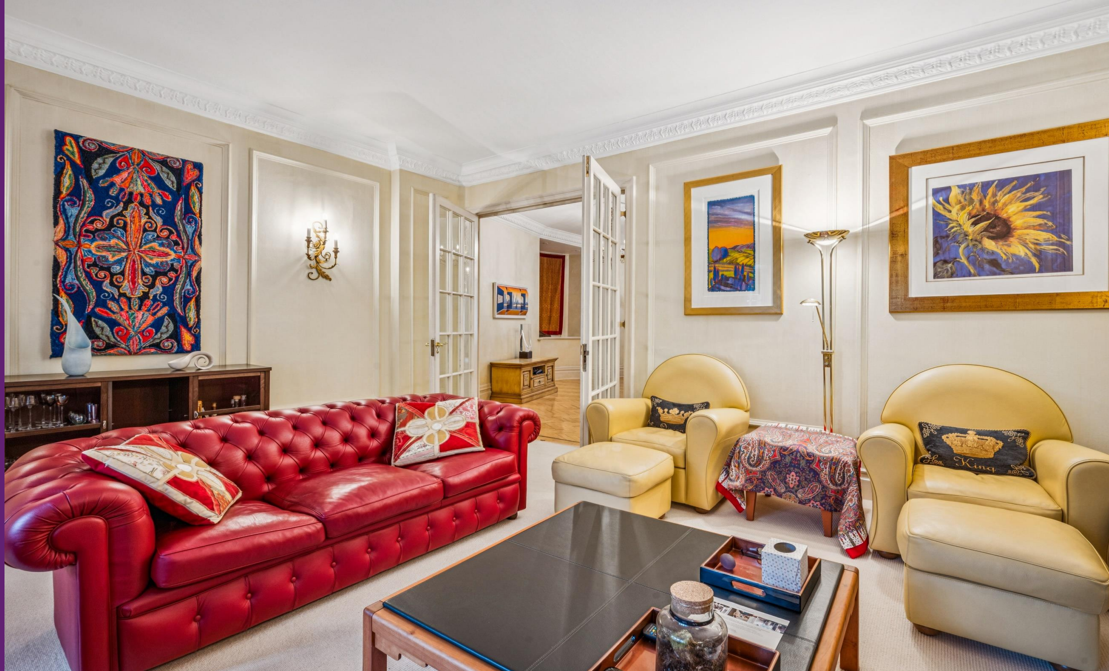
Parkside Knightsbridge, SW1X