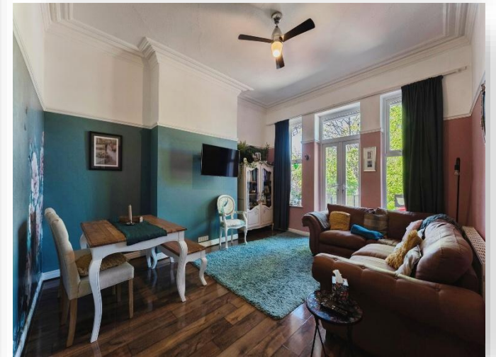
Egerton Park, Rock Ferry, Birkenhead, CH42 4RB