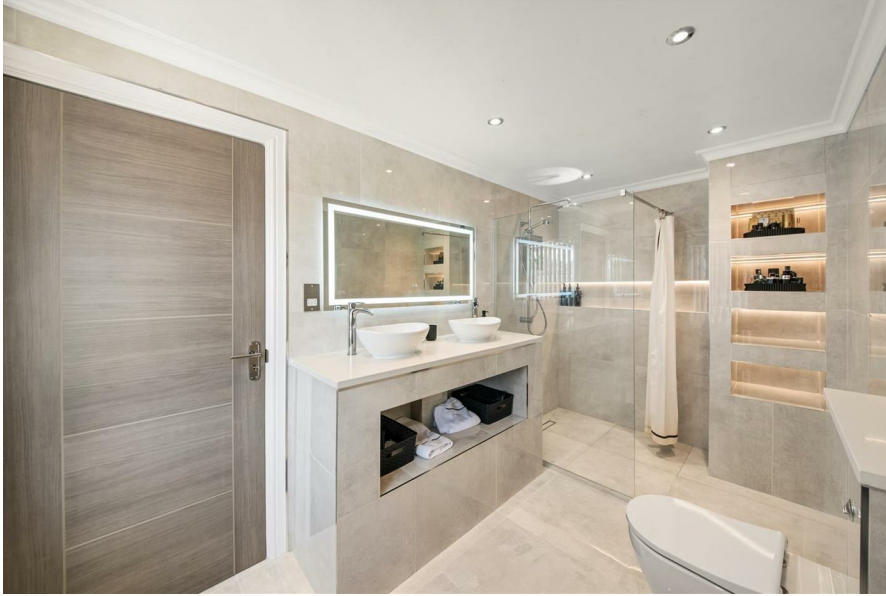
Shower Room / Toilet

159 Charville Lane, Hayes, Middlesex UB4 8PB