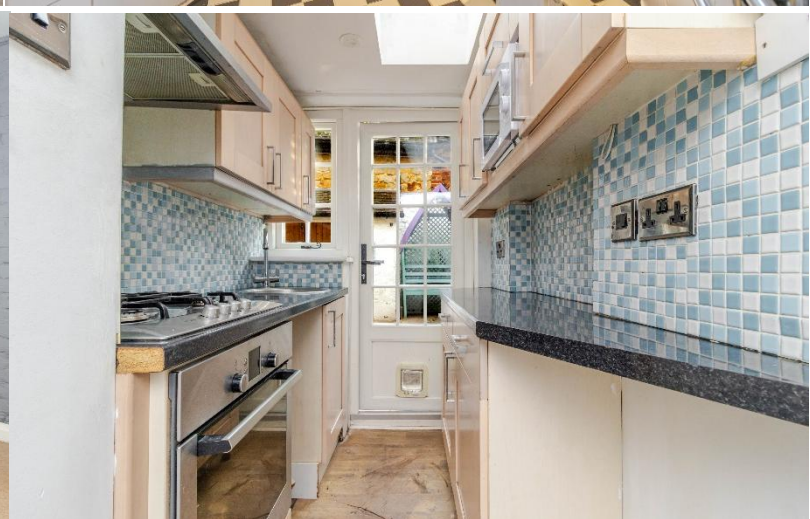
2 YEW TREE COTTAGES, GODSTONE GREEN GODSTONE, SURREY, RH9 8DZ