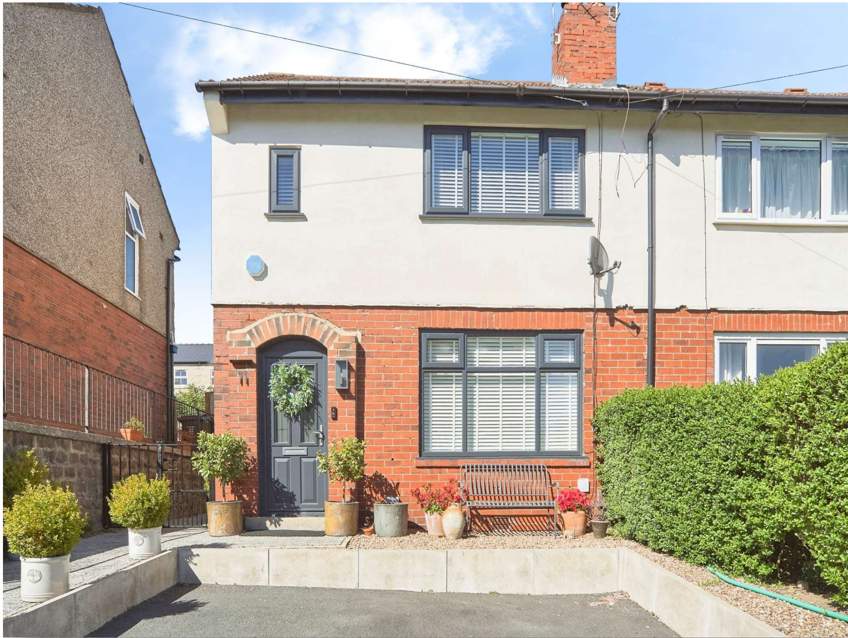
The Grove, Baildon ShipleyBD17 5NQ