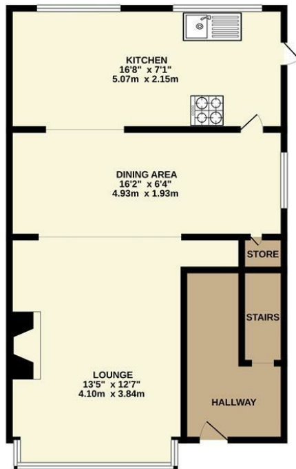
GROUND FLOOR 419 sq.ft. (38.9 sq.m.) approx.