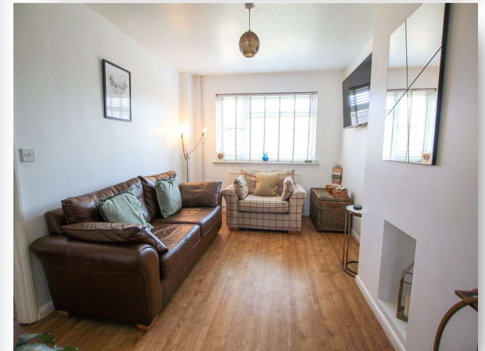
12 Holme Close, Oakington, Cambridge, CB24 3AP