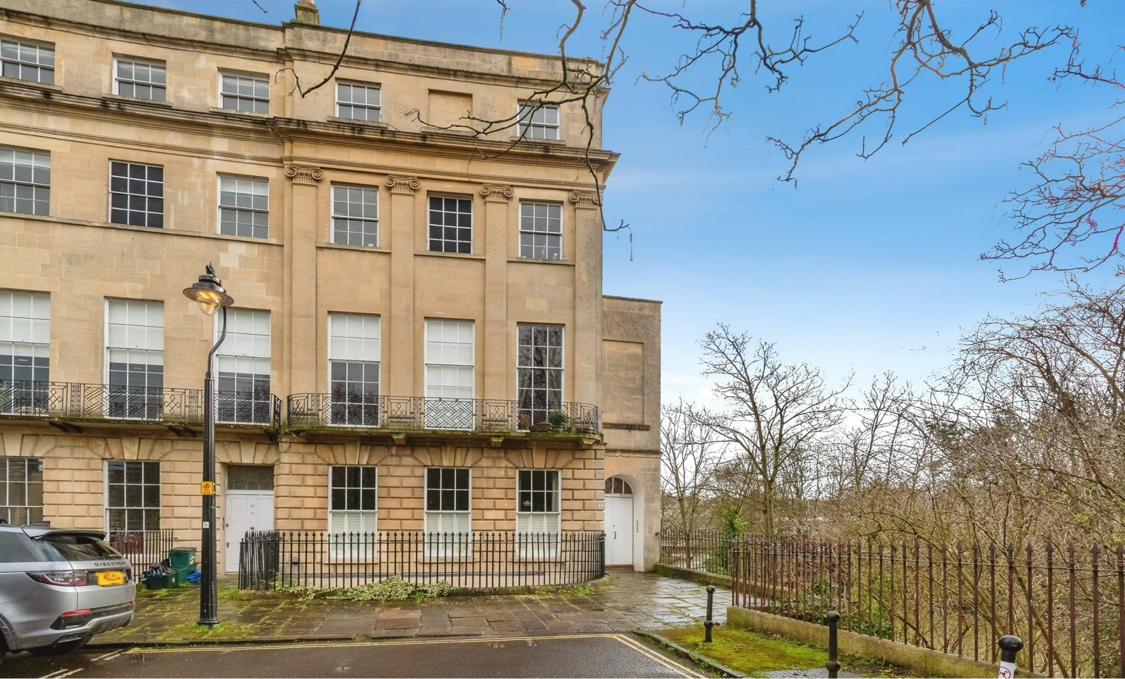
Norfolk Crescent, Bath BA1 2BE