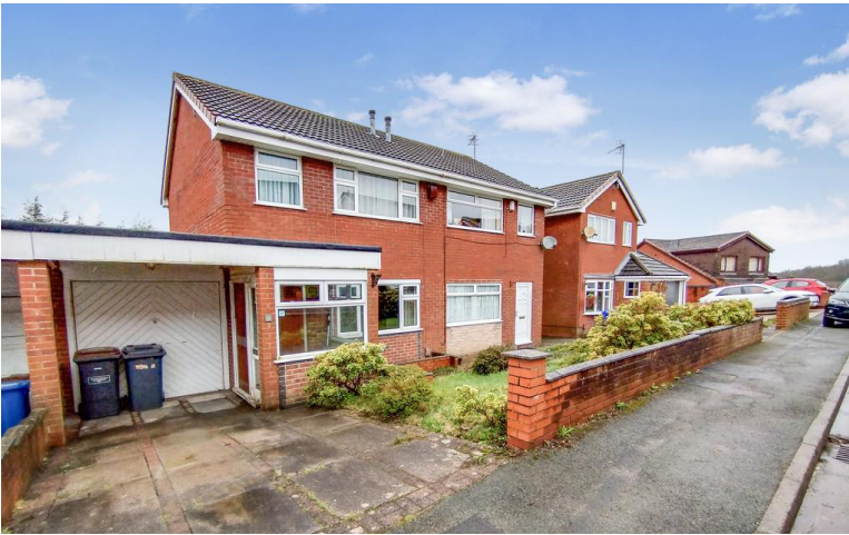
21 Peckforton View, ST7 4TA