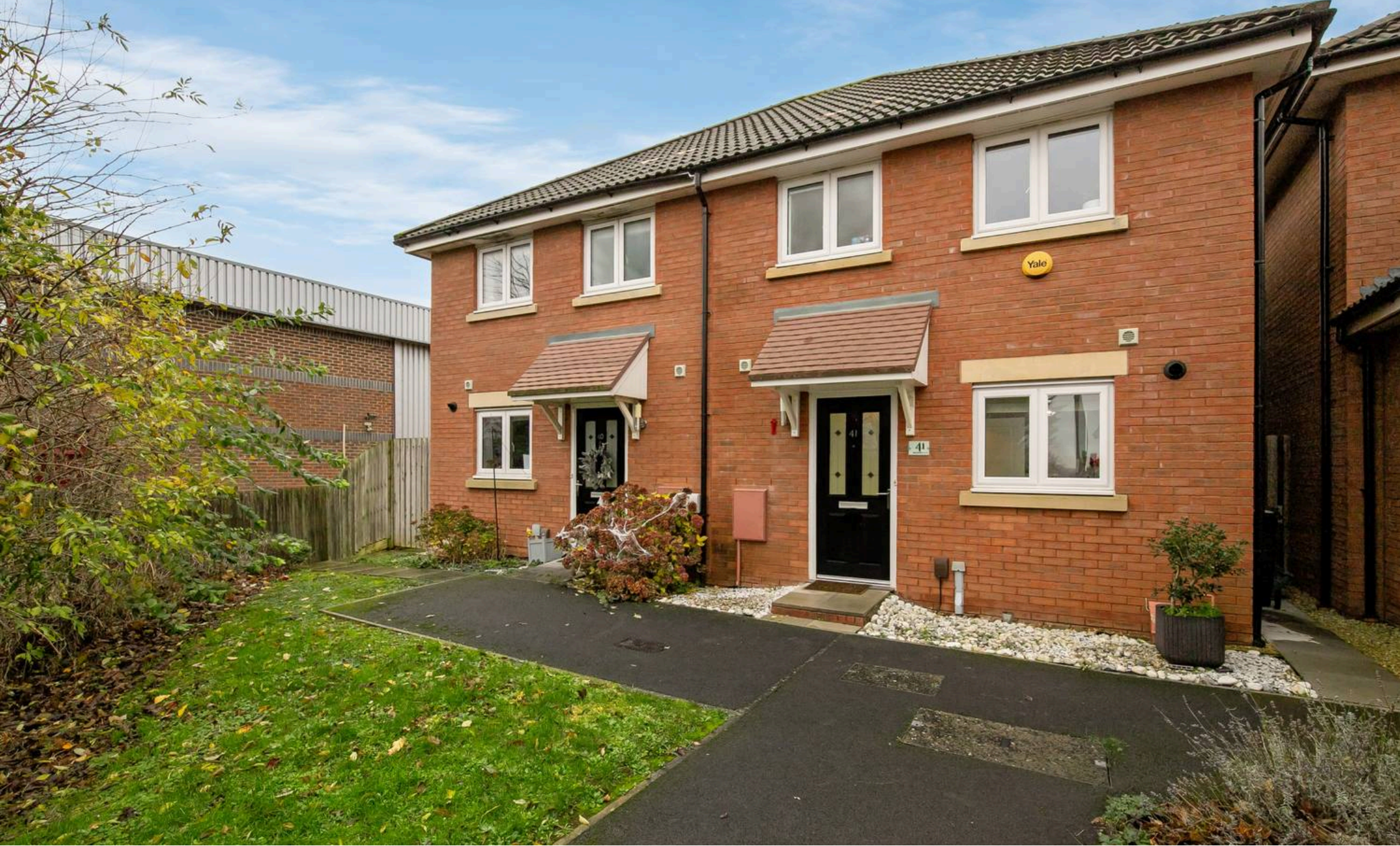
41 Brickworks Close, Bristol £350,000