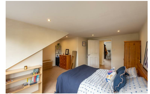
TOP FLOOR 1091 sq.ft. (101.4 sq.m.) approx.