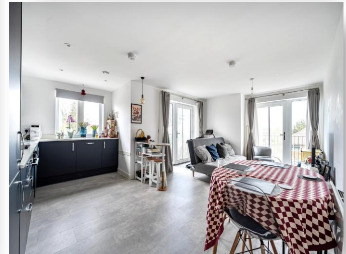
13 Thatcham House, Clivemont Road, Maidenhead SL6 7BW