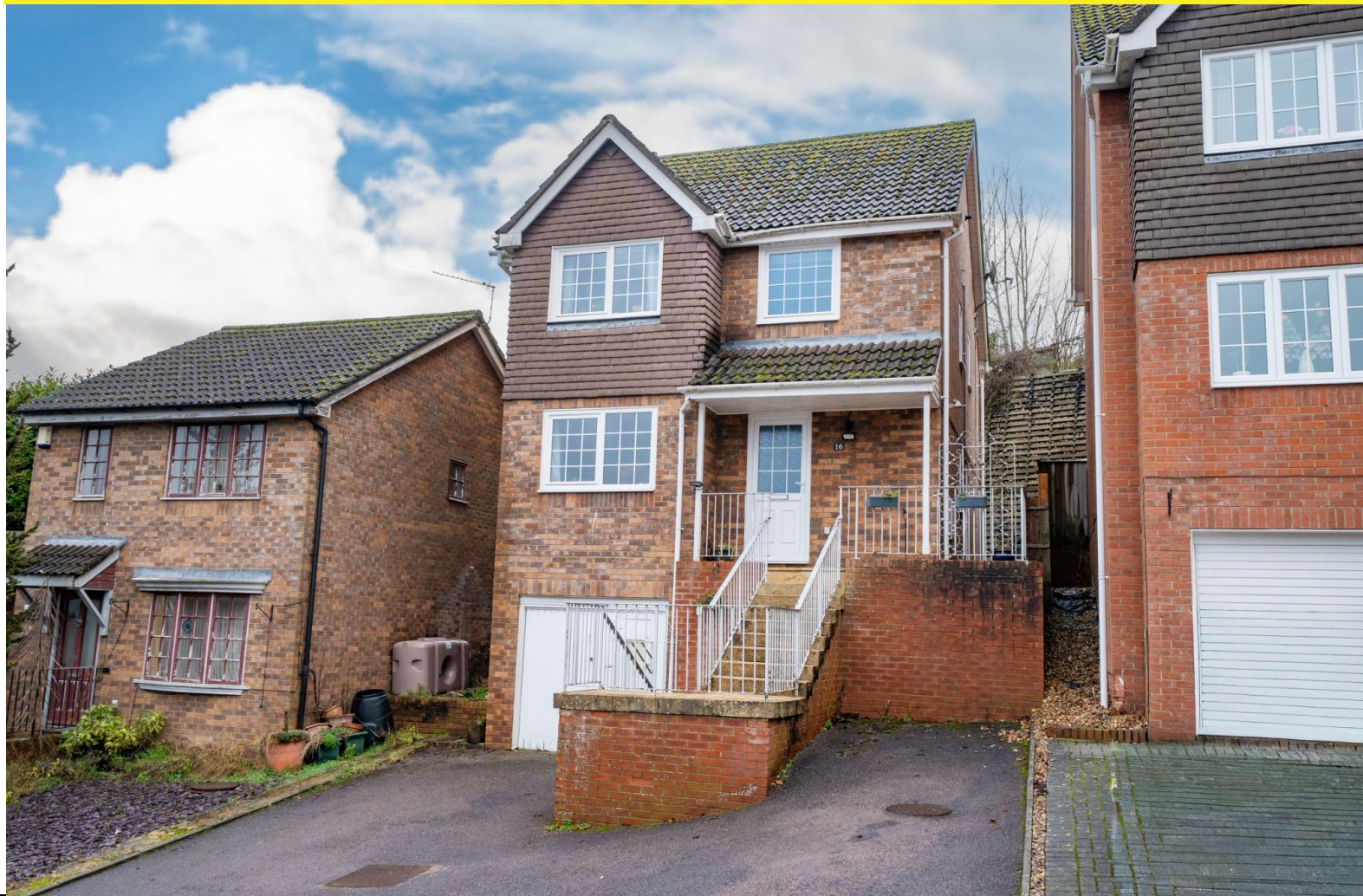
Cornfields, Andover, SP10 2EY Guide Price £395,000 Freehold