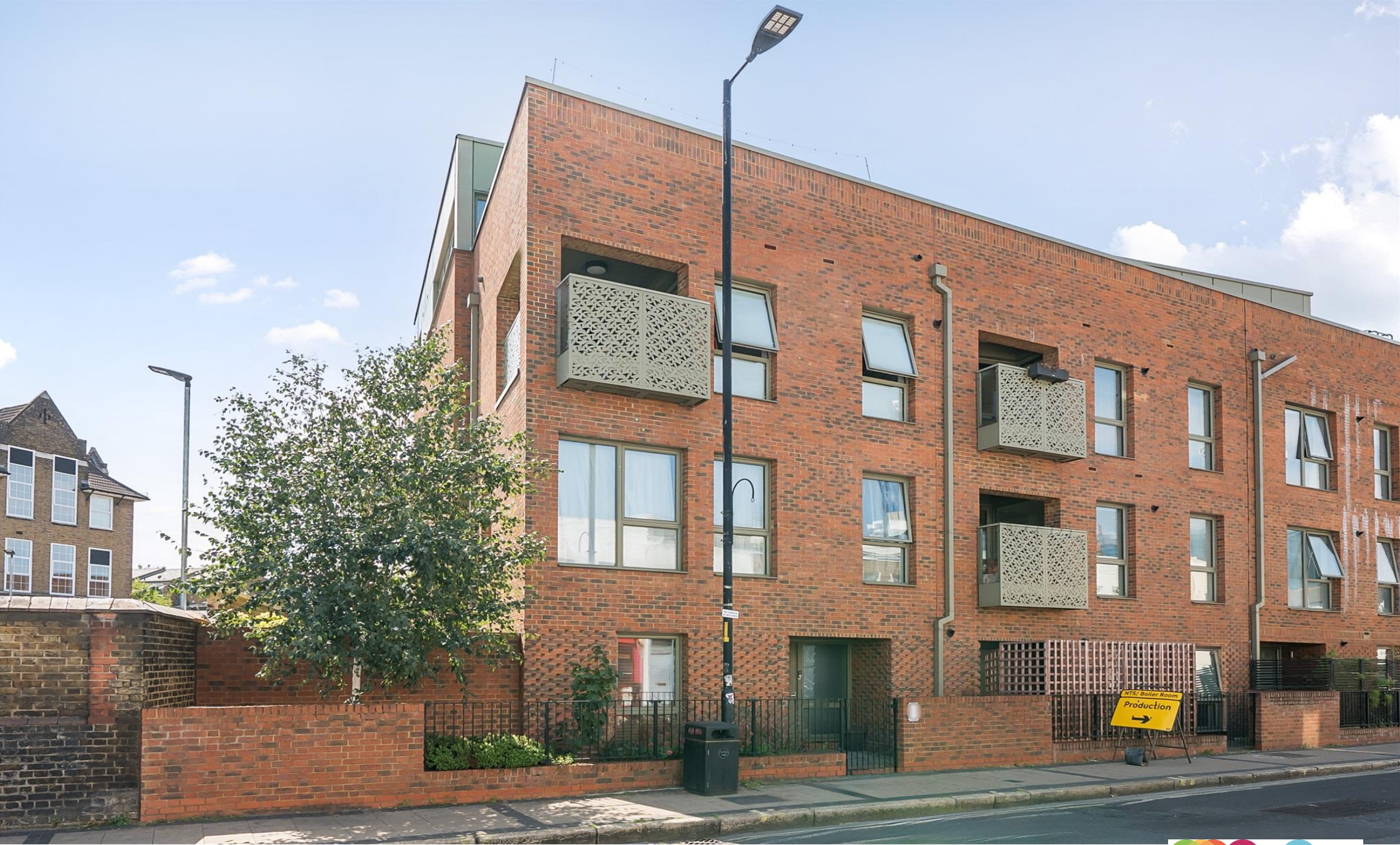
Southampton Way, London SE5