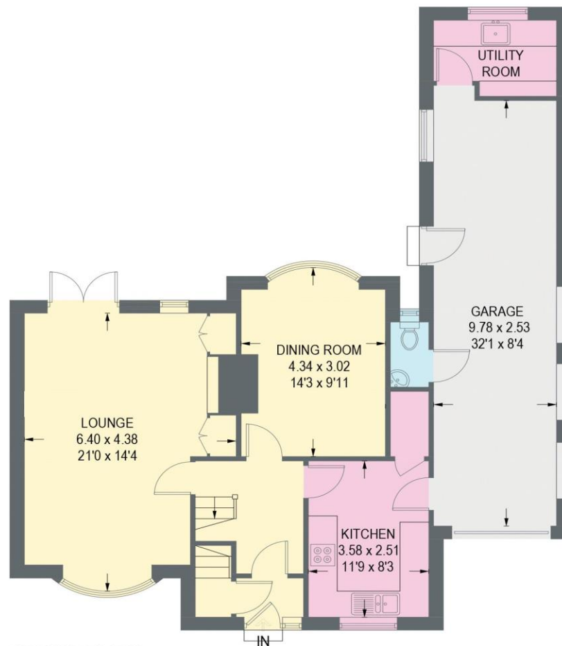
GROUND FLOOR 88.3 SQ M / 950 SQ FT