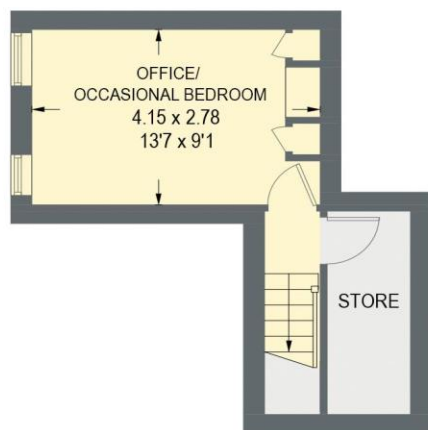
BASEMENT 17.9 SQ M / 192.8 SQ FT