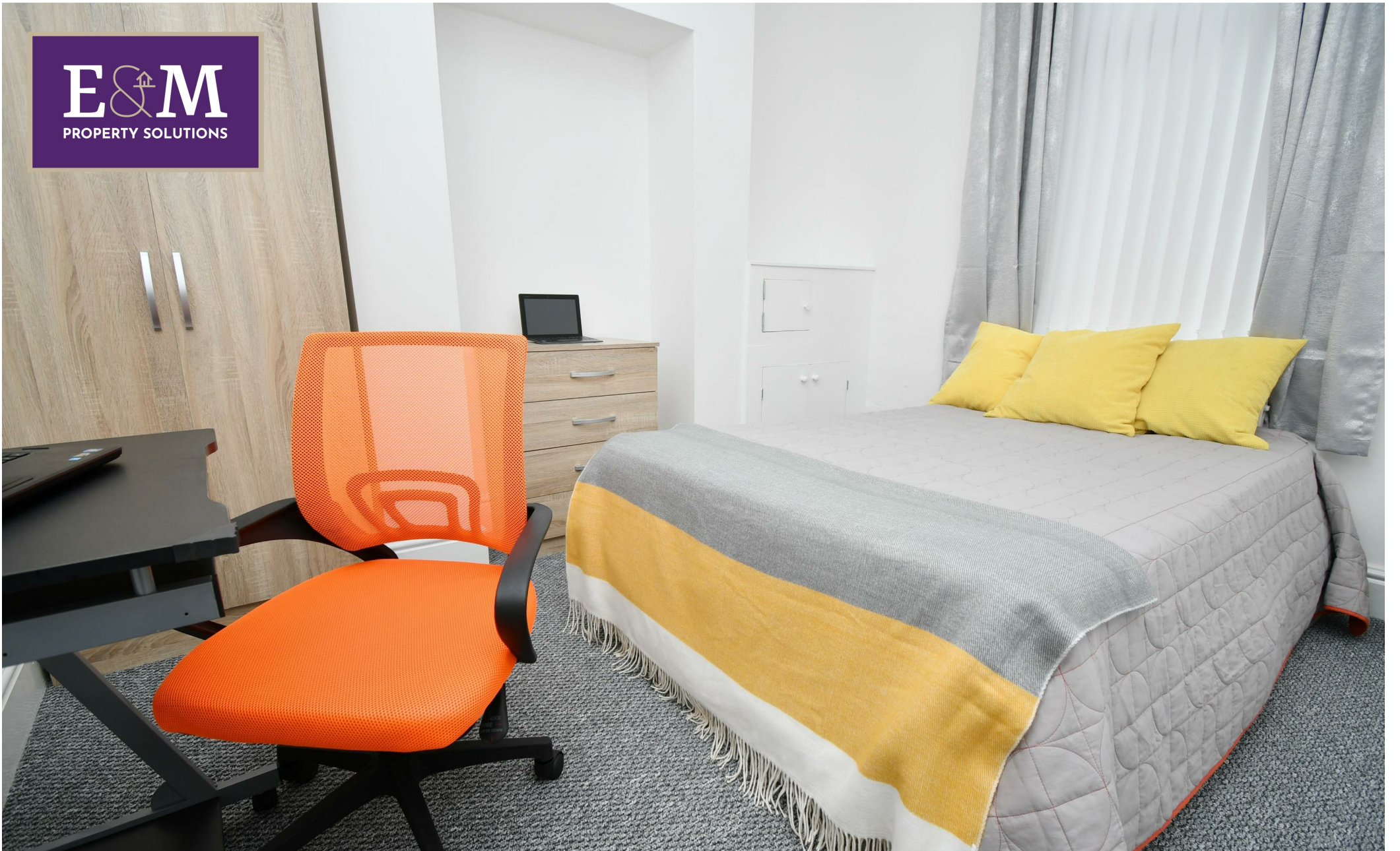
ROOM 1, 19 Netherby Street, Burnley, Lancashire, BB11 4NR £95 Per week