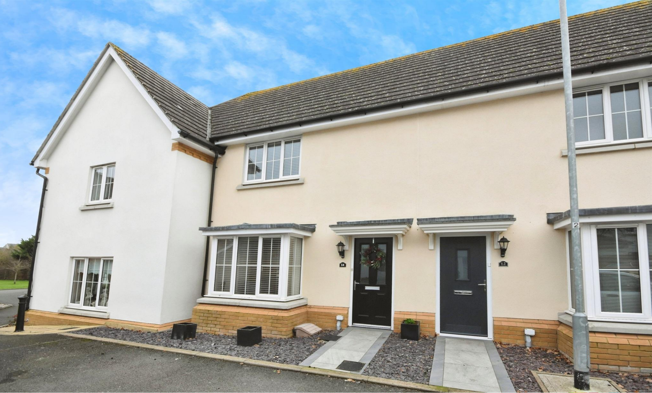
Hopwood View, Great Baddow Chelmsford CM2 9FL