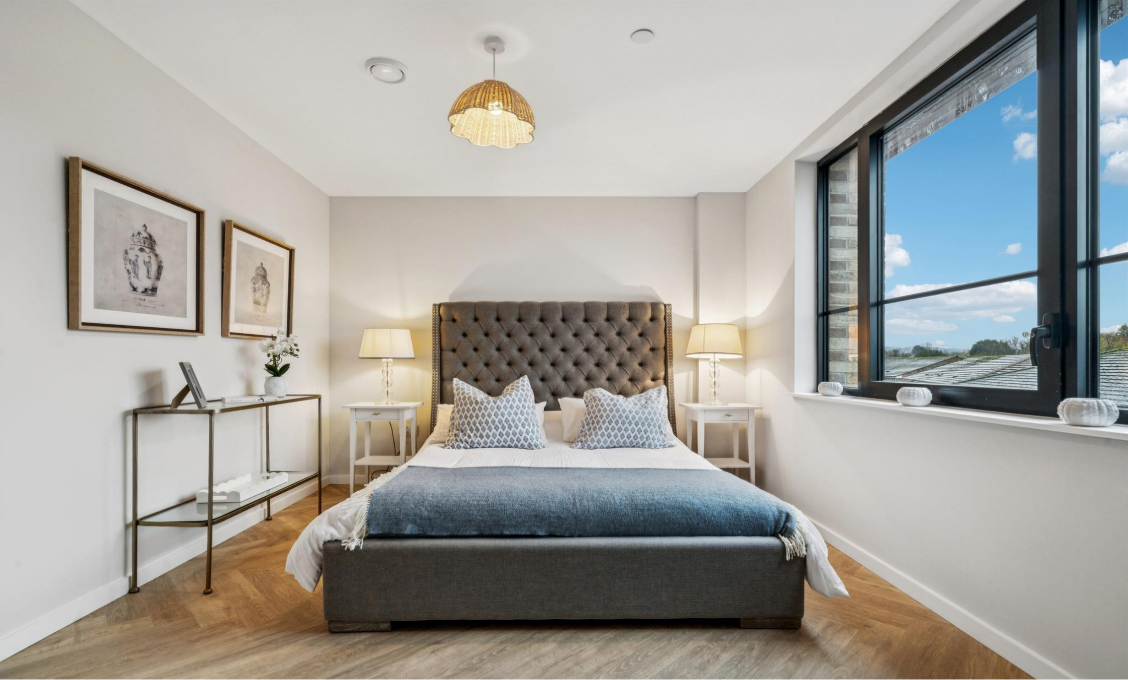
Meadow House Fallsbrook Road, London SW16 6DY