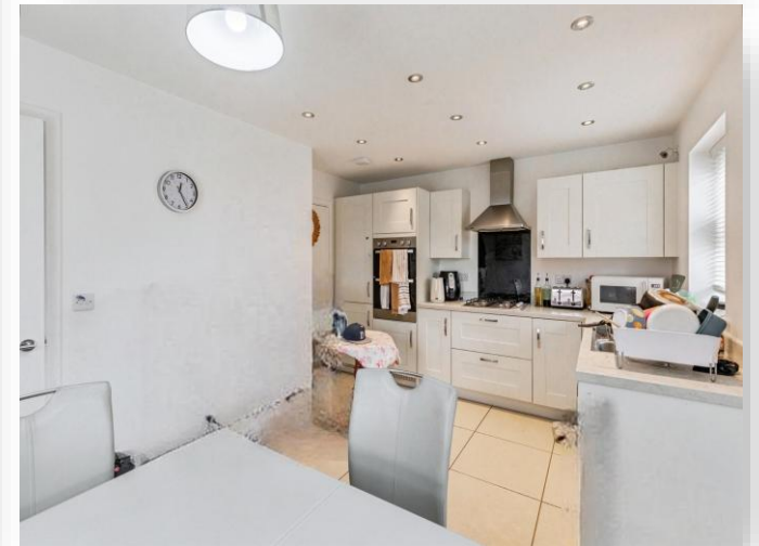
Pryor Road, Kettering NN15 7FD