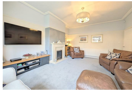
GOLF | CHARLOTTE HOUSE, GROUND FLOOR, 35-37 HOGHTON STREET, SOUTHPORT, MERSEYSIDE, PR9 0NS