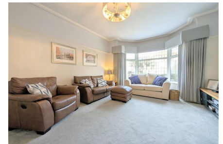
GOLF | CHARLOTTE HOUSE, GROUND FLOOR, 35-37 HOGHTON STREET, SOUTHPORT, MERSEYSIDE, PR9 0NS