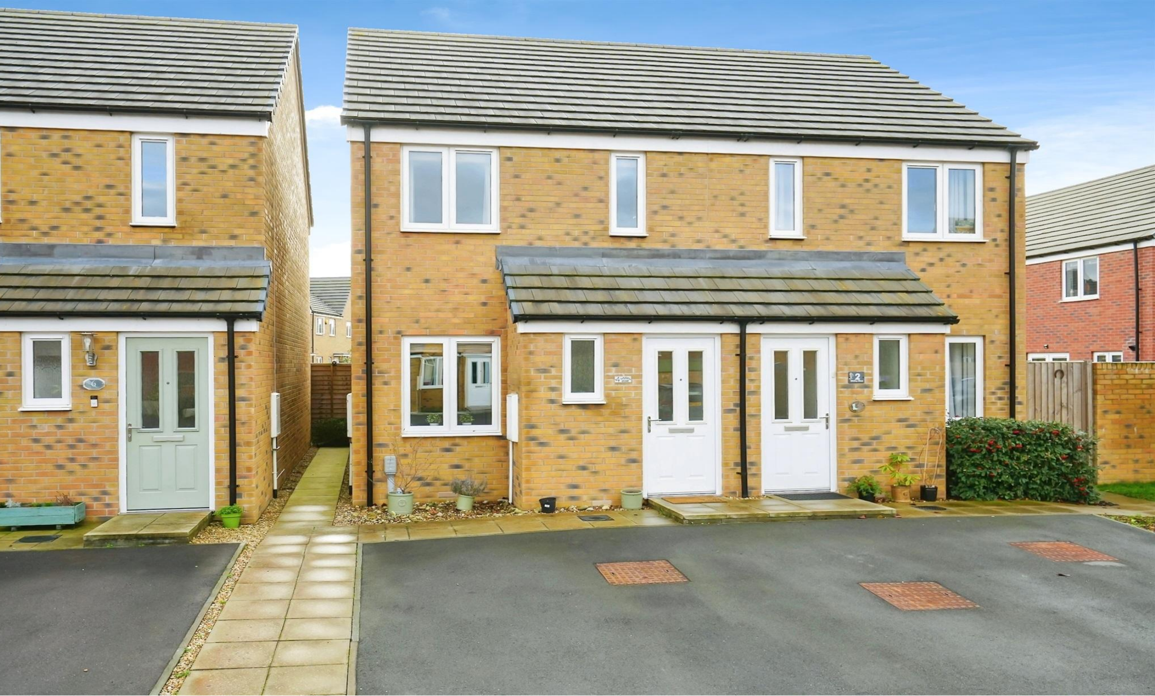
Whitley Close, Grove, Wantage OX12 0GE