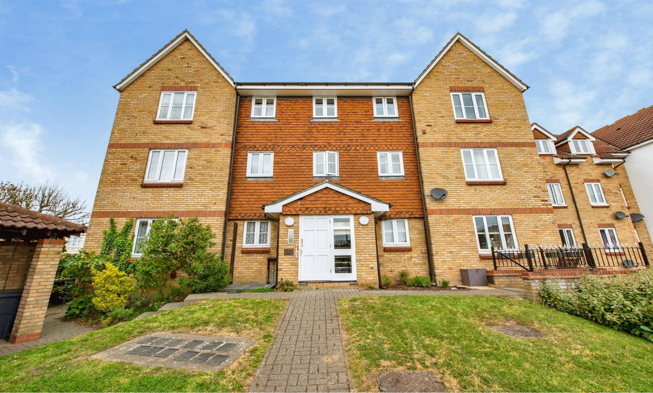
Highgrove Mews, Grays RM17 6XD