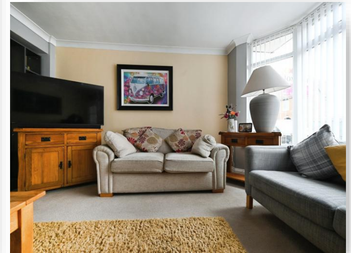
St. Thomas's Road, Gosport, PO12 4JX