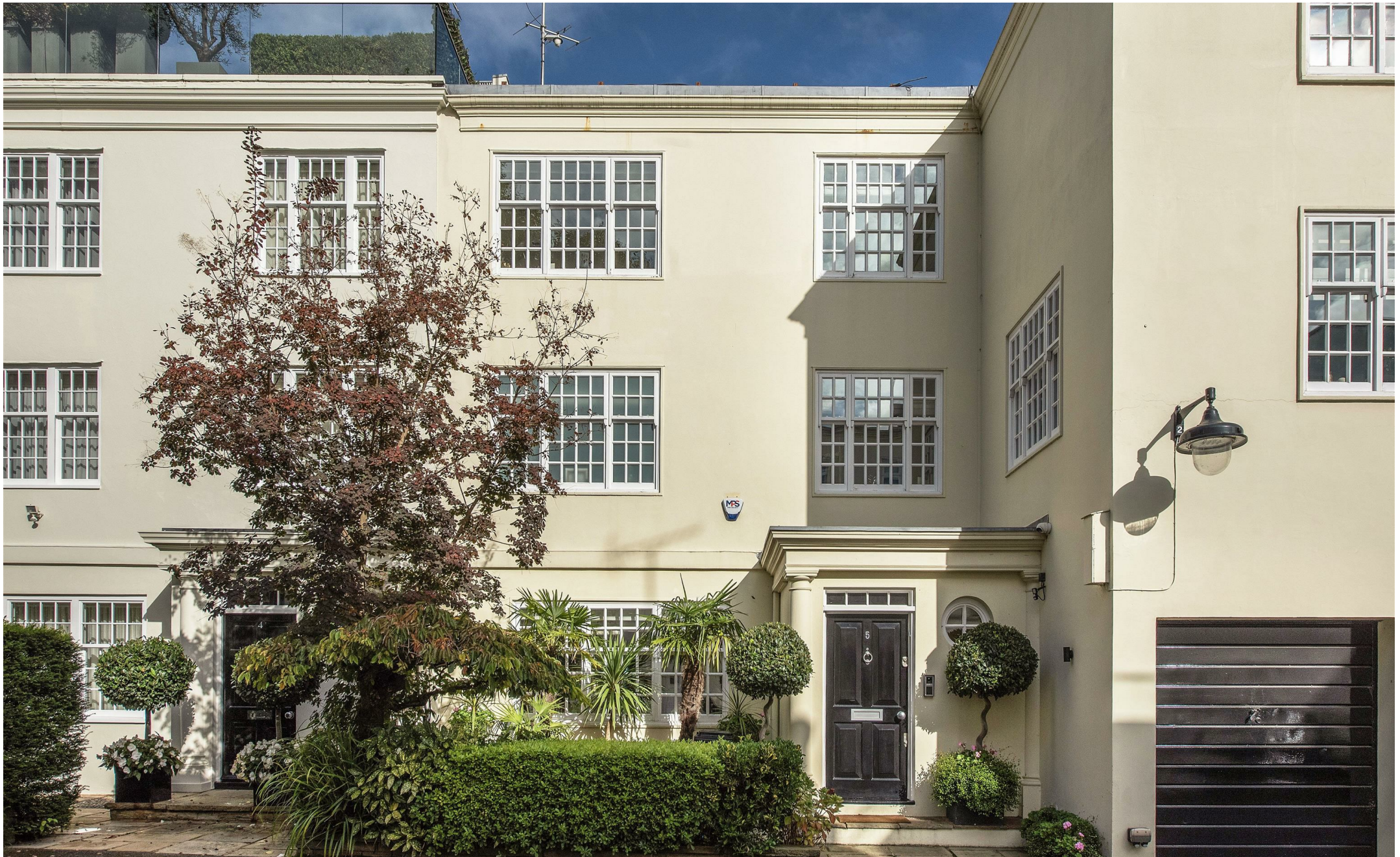
5 Elm Tree Close, St John's Wood London NW8 9JS Asking price £5,750,000 Freehold